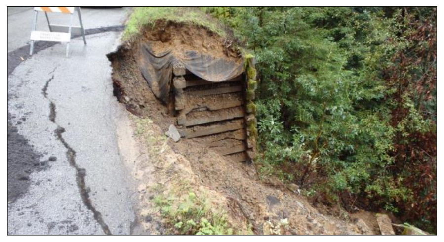
Miller Cut Off was one of several County roads damaged during March storms.

El Niño rains finally came in March — all at once, it seemed — prompting brief evacuations, knocking over trees and triggering mudslides. County crews worked long hours to clear streets and make sure residents could get home. The Board of Supervisors later declared a local emergency to help pay for damage repairs, estimated at more than $11 million.