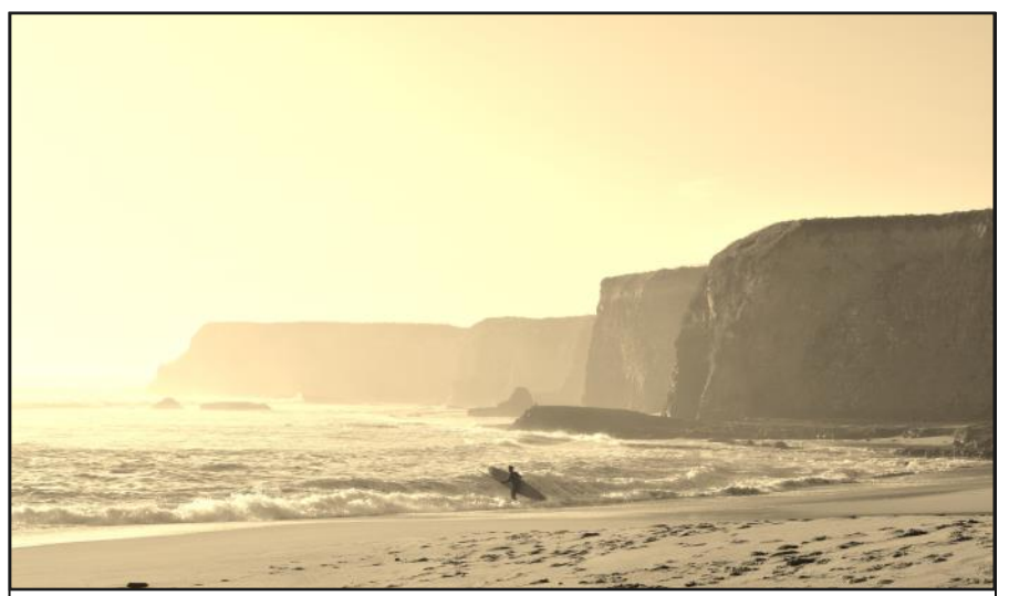
A paddleboarder enters the surf at Davenport Landing, one of many beaches managed by the Santa Cruz County Parks Department. Go to <a href="https://www.scparks.com">www.scparks.com</a>.