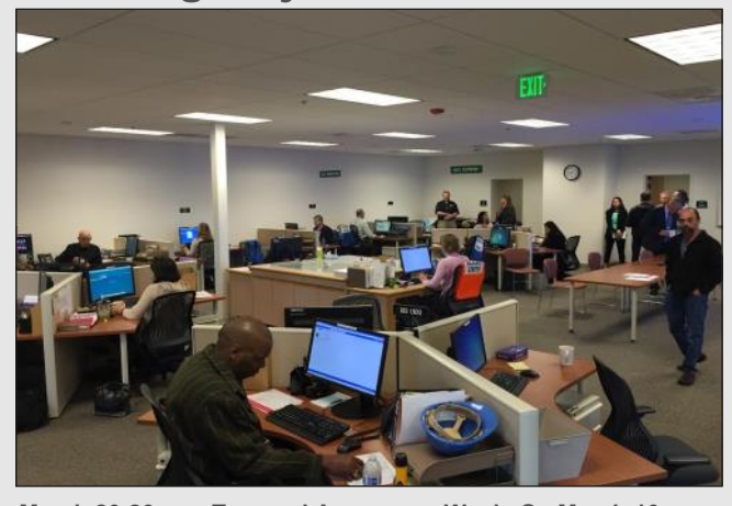
March 20-26 was Tsunami Awareness Week. On March 16, staff from various agencies gathered at the Emergency Operations Center to train for a scenario where a large tsunami strikes the county during a summer holiday.