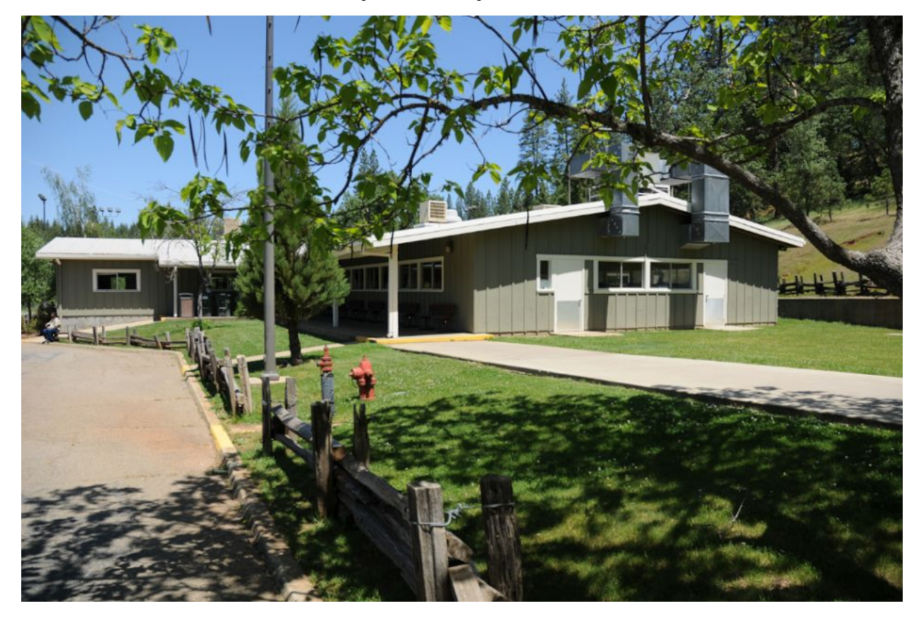
Ben Lomond Conservation Camp #45 – Inspected on March 30, 2017

The Ben Lomond Conservation Camp #45 (Fire Camp) gives an excellent first impression, with the usual forestry "green and groomed" look. The buildings, although dating from 1962, are well maintained. This is a minimum-security facility with monitored security cameras and out-of-bounds signs. Walk-aways (escapes) happen infrequently for a minimum security facility; only one in FY 2016-17.<sup>[20]</sup> The camp has a capacity of 113 males. There were 89 inmates on the day of our visit.