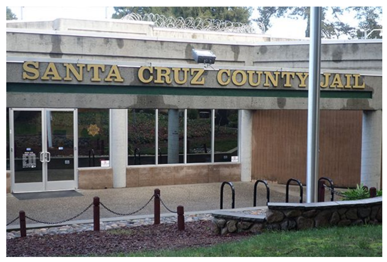
Water Street Maximum Security Jail – Inspected on September 12, 2016