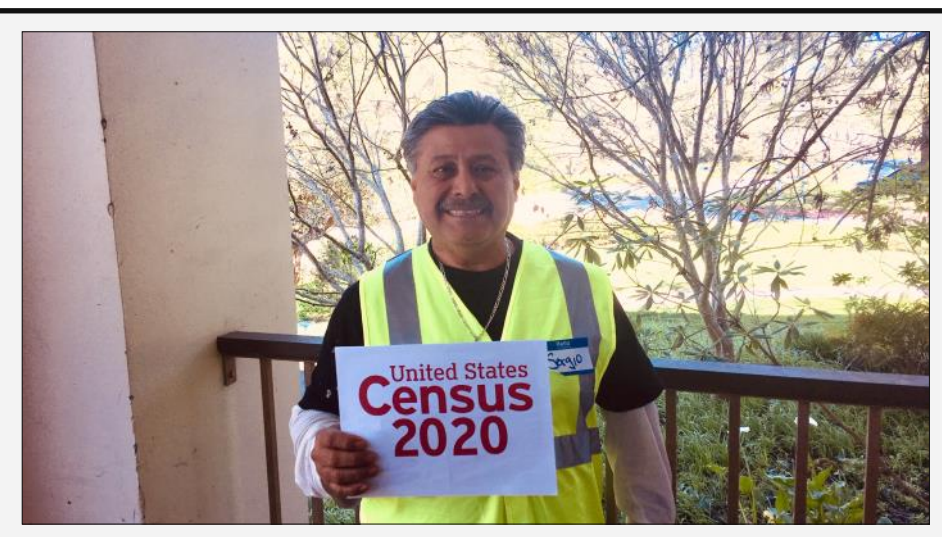
The 2020 Census is around the corner, and the County outreach efforts are ramping up. Stay in touch at www.santacruzcountycounts.us.

"The interim resolution is a vote of support by the nation's largest organization representing counties for communities such as the Pajaro Valley, which live in constant fear of flooding but have been left unprotected due to their economic status," Friend said. "This is an important step forward not just for the Pajaro Valley, but for all low-income communities living in the shadow of inadequate flood protection."