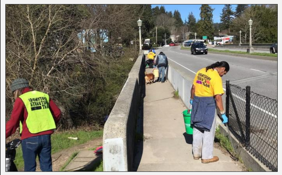
Members of the Downtown Streets Team clean the sidewalk near downtown Felton.

We've always updating our awardwinning Citizen Connect app to give you access to anytime, anywhere services. Download Citizen Connect for iTunes and Google Play.