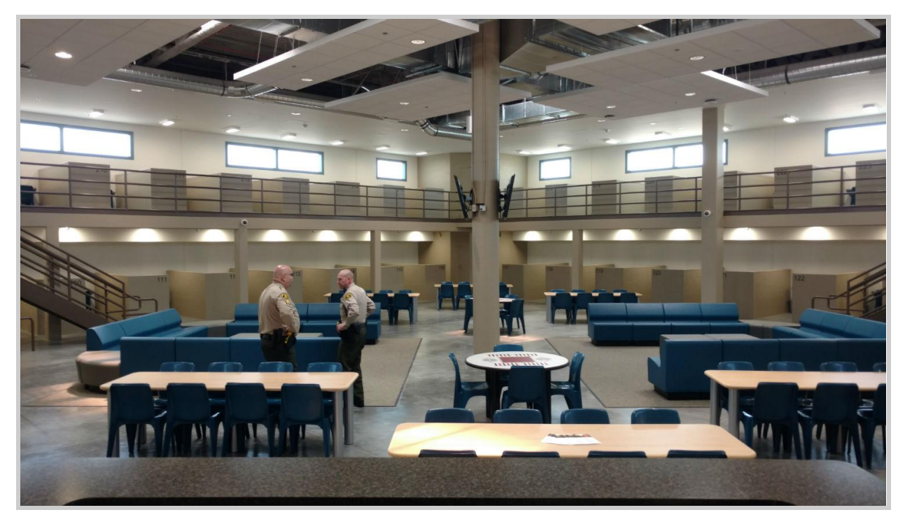
Figure 2. Rountree Rehabilitation and Re-entry Facility

The Main Jail is used to house inmates deemed a high security risk. Most are pretrial, even though they may have been incarcerated at the Main Jail many years.<sup>[11]</sup> The Grand Jury is concerned about the civil rights of those detained long-term without being convicted, but that question is beyond the scope of this investigation. However, living in this unending limbo must have a negative effect on the inmates. Those who have never been incarcerated cannot imagine what life is like behind bars, especially the dungeon-like Main Jail. Inmates may be locked in their cells for 23 hours a day and let out for an hour of exercise in a small area open to the sky, but still without a view of any green plant. The exercise hour might be in the middle of the night!<sup>[12]</sup> Exorbitant cost of the commissary and phone calls are also a common inmate complaint.<sup>[13]</sup>