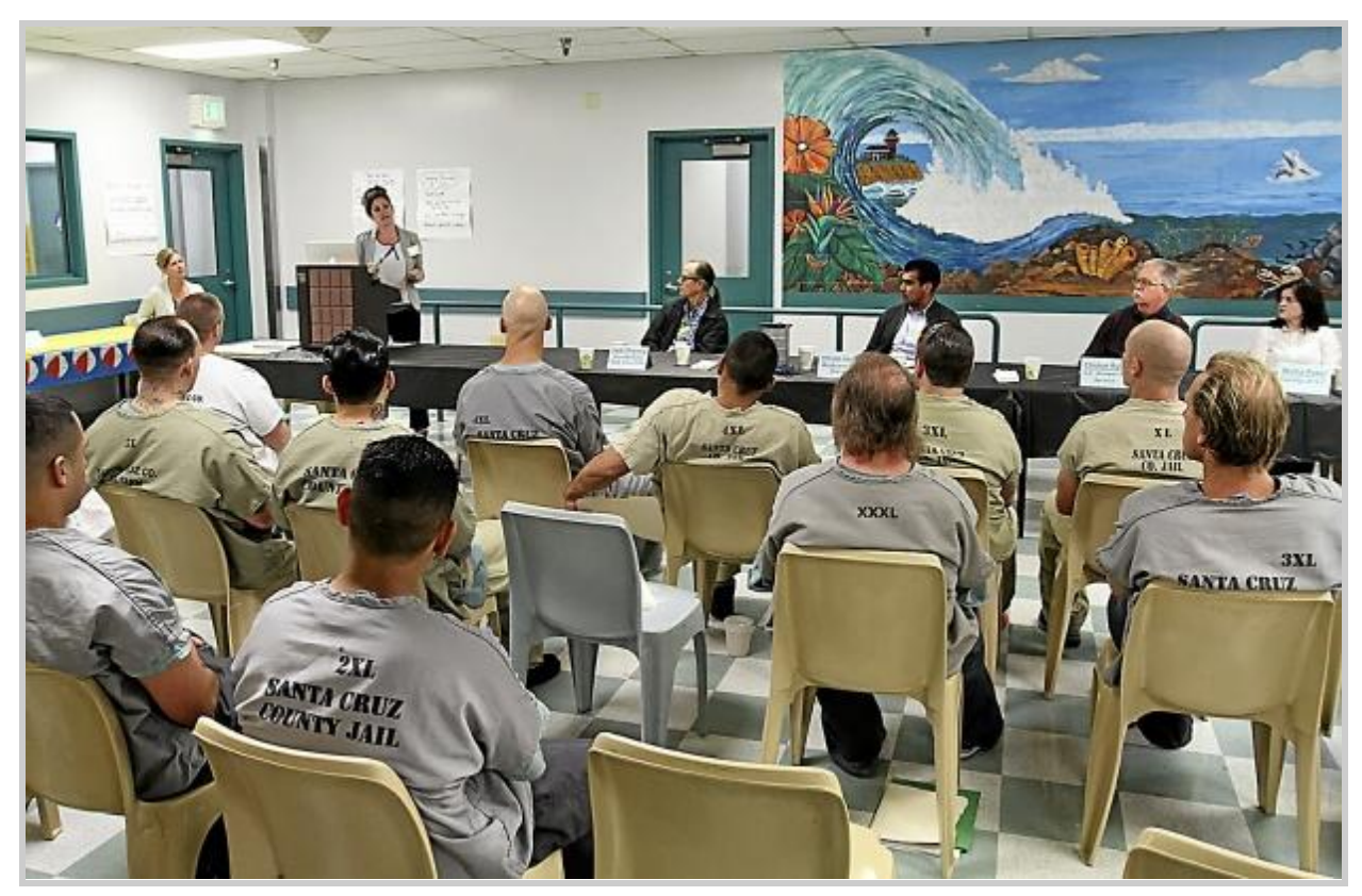
Figure 3. "Paths out of Jail" Class at Rehabilitation and Reentry facility

Rountree is where lower level offenders are housed. Rountree includes two medium security units and the minimum security Rehabilitation and Re-entry facility. Unlike the Main Jail, Rountree is spacious, with outdoor exercise areas including basketball and handball. The Grand Jury watched inmates weeding their home-grown vegetable plots.